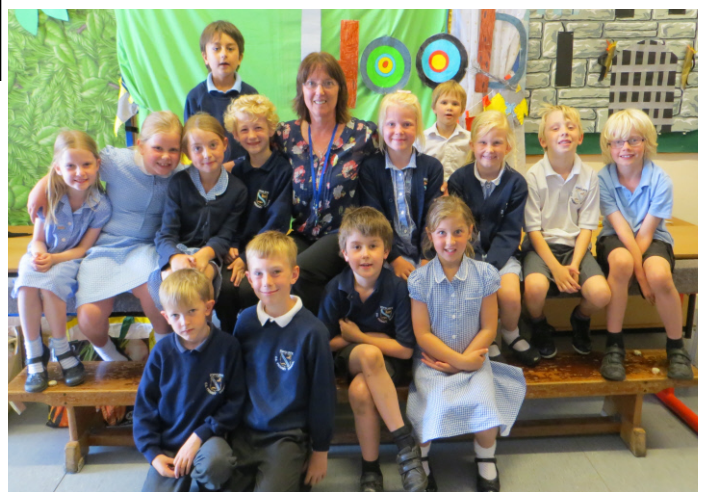
Goodbye to an enthusiastic and popular headteacher

the head teacher acknowledges that much of this is down to her excellent team.