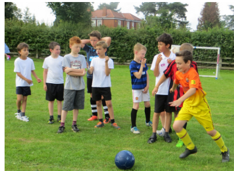
Nobody gave Gareth Southgate a thought when the match went to the dreaded penalties.

Topcliffe School held a great sports-filled afternoon in aid of CLIC Sargent. There was netball and football with everyone joining in, which seemed to work better than you might think. It was a competitive combination of small people and big people and everyone was out to win. Parents were running one or two stalls and a teacher gamely allowed herself to be the sitting target of a cold wet sponge, thrown at her by gleeful pupils.