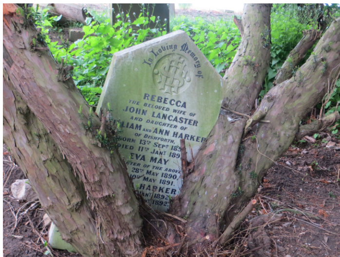
A lady died, was buried and came back to earth as a tree.