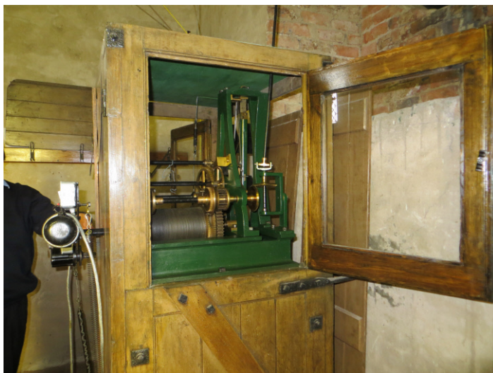
The tower clock made by the famous firm of T Cooke of York and installed in 1858. It is No 4 and is the earliest turret clock by this maker that survives; numbers 1-3 no longer exist for various reasons! No 3 for instance was installed at St Martin le Grand, Coney St, York but was destroyed by a bomb during World War 1!