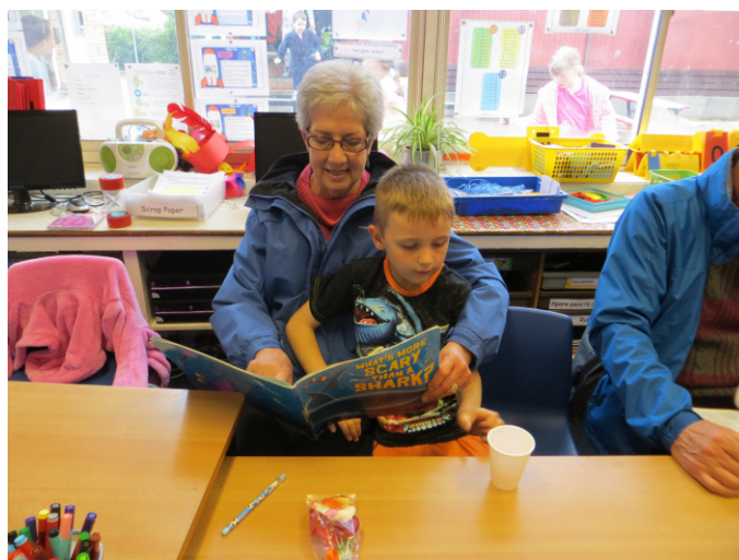
The school's recent Pyjama Day was in aid of the purchase of new laptops but the traditional art of reading with children and grandchildren was celebrated.