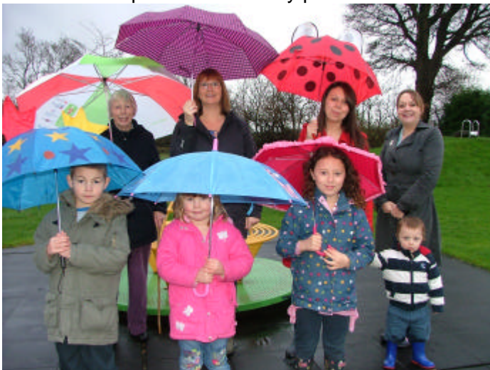
Fundraisers and young beneficiaries on a very wet park

Thank you to everyone for all your support and encouragement in making this much needed addition to Topcliffe Community possible.