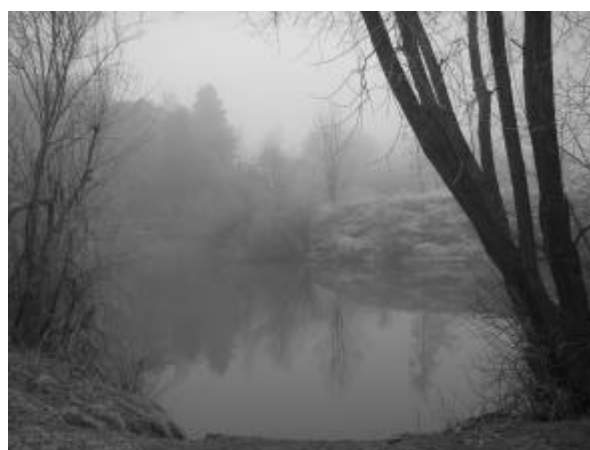
A photograph of a wintry Sheepwash without litter.