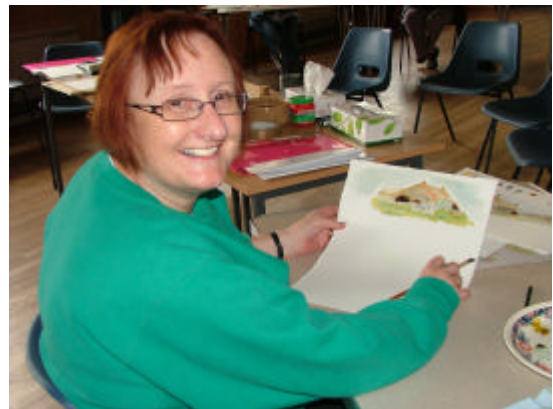
"Impression of an Artist at Work"